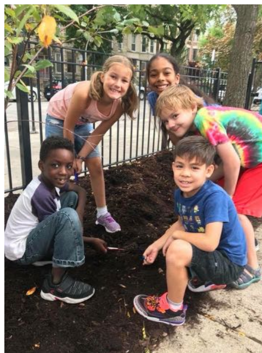
Agassiz students helped plant new trees on our playground for the International Day of Peace on Friday, September 21, 2018.

These programmes encourage students across the world to become active, compassionate and lifelong learners who understand that other people, with their differences, can also be right.